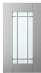
EDWARDIAN CARVED FRAME includes clear glass