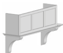
OVERMANTLE 1150 X 450 X WIDTH MIN (W): 1400 MAX (W): 1900