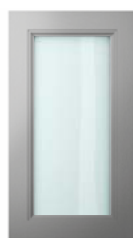
PLAIN FRAME includes clear glass