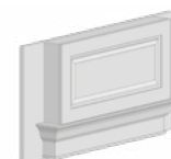
MODERN CANOPY 575 x 1000 x 300