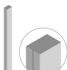
TALL FEATURE END POST 3000 X 50 X 75