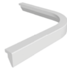
QUADRANT LIGHT PELMET 55 X 430 X 430