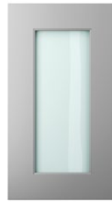
PLAIN FRAME includes clear glass